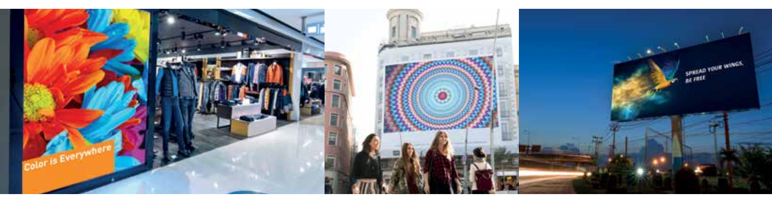
In-store communication - self-adhesive vinyl

The Anapurna RTR3200i LED plus white operates with Agfa Graphics' latest generation of white inks, which are highly opaque. This means you obtain a qualitative white output with low ink consumption on colored or dark substrates, as well as on transparent material for backlit or backlit/ frontlit applications. Alternatively, you can use white simply as a spot color. Also, the Anapurna RTR3200i LED plus white has the possibility to run pre- and/ or post-white concurrently in one production run, greatly expanding application possibilities.