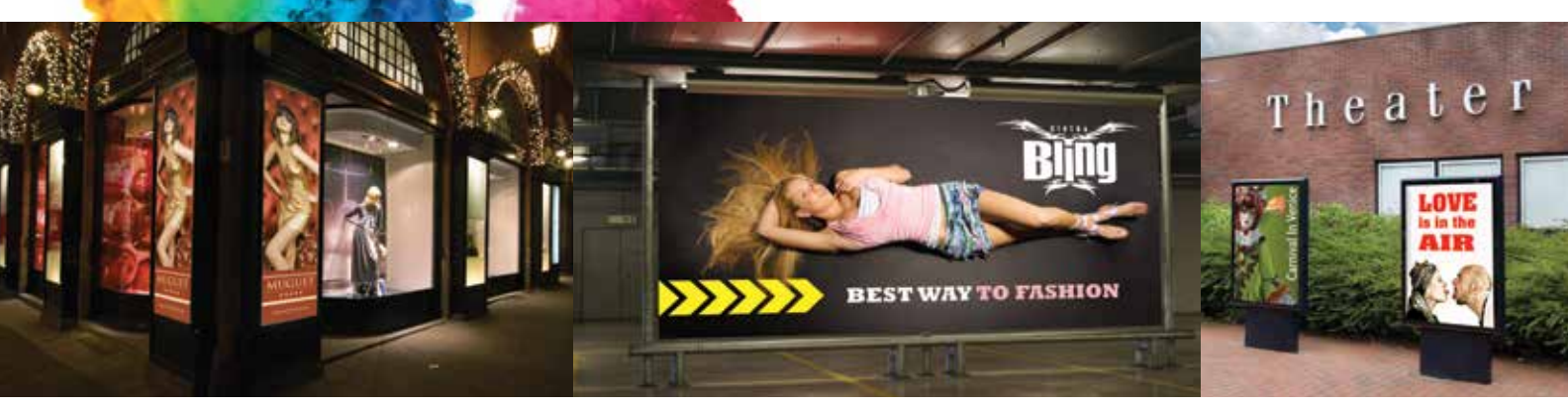
In-store communication - backlit

Printing on backlit media? Creating an opaque white background? Using white as a spot color? The Anapurna RTR3200i LED supports white printing in multiple modes (e.g. pre-white, post-white, sandwich white) on both rigid and roll media. The stirring functionality keeps the white ink in motion at all times. Constant recirculation flows along the ink lines – all the way to the temperature-controlled printer heads – limiting the risk of ink resettling and lines becoming blocked or clogged.